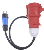
CEE 5pin 16A CZ SCHUKO 16A 230V 1m