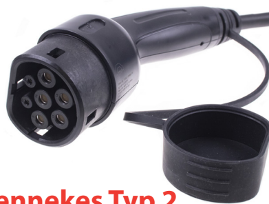
Mennekes Typ 2