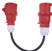
CEE 5pin 32A CEE 5pin 16A IP44