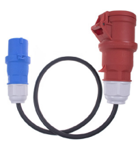
CEE 5pin 16A CEE 3pin 16A 230V 1m kempingová zásuvka