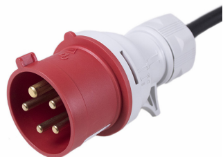
CEE 5pin 400 V