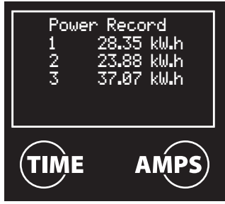
Charging cycles history screen