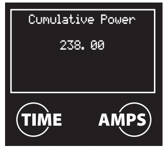
Total energy value screen

By disconnecting the charger from the power supply and reconnecting it again, you will return to the basic mode of the charging setting